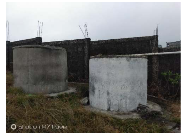
Maintenance of water bodies and distribution system in the campus: