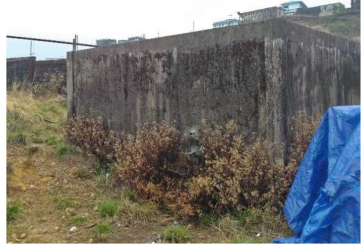
Rain Water Harvesting inside the college Campus.